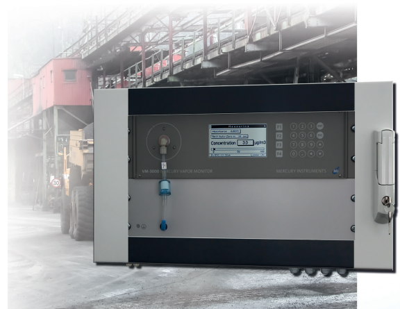
Option: Due to the great demand the VM-3000 with dustproof enclosure is now available in our regular product line. It is meant for stationary wall or stand mounting in areas soiled by particulate matter.