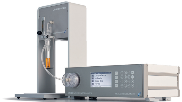
Extension: Rapid mercury determination in the laboratory with the Mercury LabAnalyzer 254